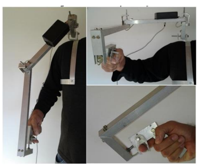
Figure 2: Master arm.

In this project it was developed a system of arm manipulator replicator of movements, with four degrees of freedom, plus the addition of a type clamp effector. It is remotely controlled using software programmable microcontrollers. Its command is performed through the Master-Slave system that performs operator arm movement replication. This handles the Master arm (Fig. 2) to control the Slave device (Fig. 3). The system was designed to withstand doses of ionizing radiation not tolerated by conventional electronic manipulators.