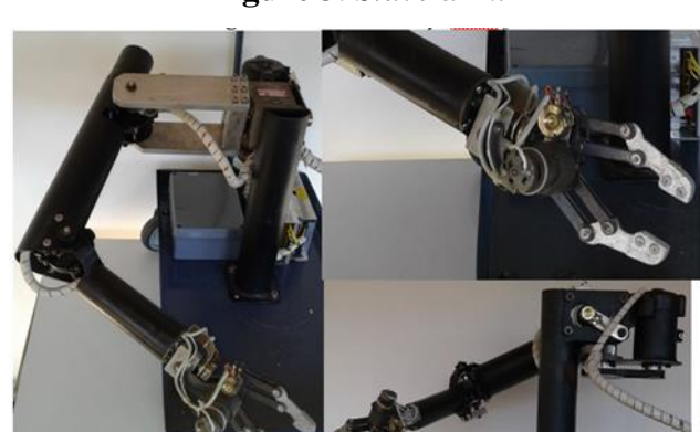
Figure 3: Slave arm.

In the construction of the equipment, it was necessary to develop a servomotor system using sensors and motors resistant to ionizing radiation. Resistive sensors like potentiometer were used. These are able to interpret the position of its axis in the form of proportional voltage at the output, relative to the power supply. DC type motors with brushes were used, which only have electromechanical elements in their construction.