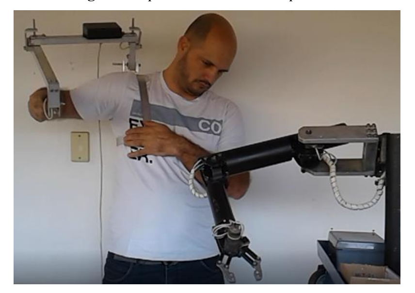
Figure 4: Operation with the manipulator.

3D modeling was performed aiming anatomical and anatomical dimensional similarity with the human arm. There were prioritized robustness, simplicity and ease maintenance. Standardized elements were used in the structure. The design was made to simplify manufacturing. Whenever possible, Computer Numeric Control - CNC laser cutting (application was used in the elements construction. The technical drawings greatly facilitated the construction of the prototype. Figure 4 shows a photograph of the operation of the prototype. Several tests were performed to evaluate the manipulator performance [7]. The tests performed are presented below.