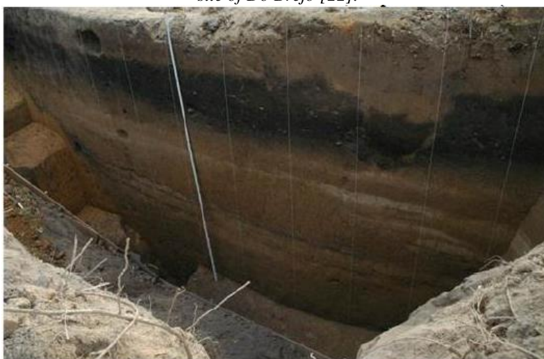
Figure 2 : Stratigraphic profile of sediment layers in the unit that reached up to 4.40 m depth from the archaeological site of Do Brejo [22].

This is a unicomponential litho-ceramic site with a black earth spot associated with the high density of archaeological material (Figure 2). Do Brejo site is located in front of Santo Antônio Island, and is inserted in floodplain. The extension of this site is 204 m × 340 m. Six areas of 2 x 1 m were excavated, depth of 1 m to 2.9 m. In the lower portion and near the river (sector 1), the excavation of a profile reached 14 m in length and 6 m in depth. The ceramic was collected mainly between levels of 20-70 cm depth, and in sector 1 up to 5.8 m.