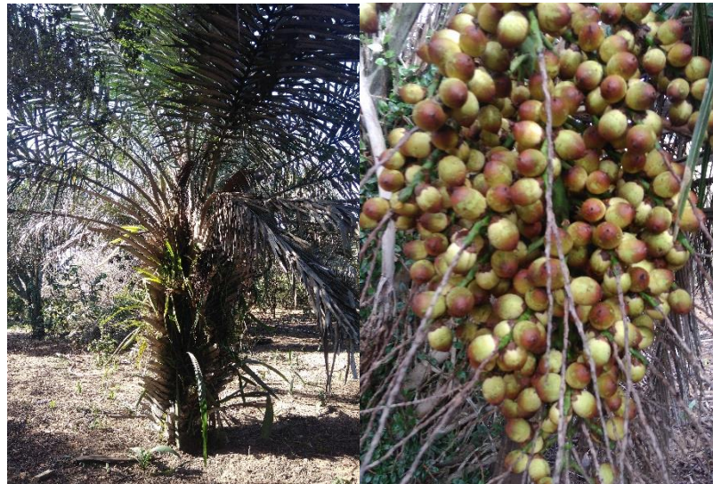
Figure 1: “Licuri” palm tree and fruit.

The fruit from “licuri” palm ( Syagrus coronata ) is extracted from palm trees in native forests. It is scientifically named as Syagrus coronata (Martius) Beccari and is a member of the Arecaceae family, Arecoideae subfamily [1]. The regional communities, agro-extractives, and family farmers know it in different names such as adicuri, iricuri, licuri, and licurizeiro. There are 36 popular name forms at least [2] (Figure 1).