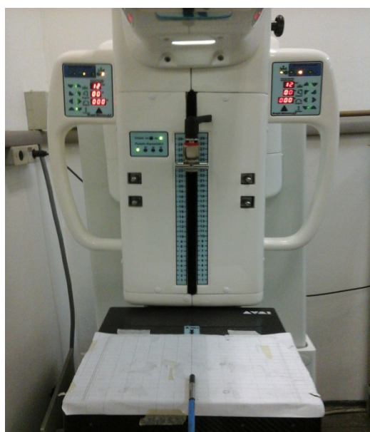
Figure 1: Ionization chamber and mammography equipment

The ionization chamber was placed on the breast support at the point of maximum beam