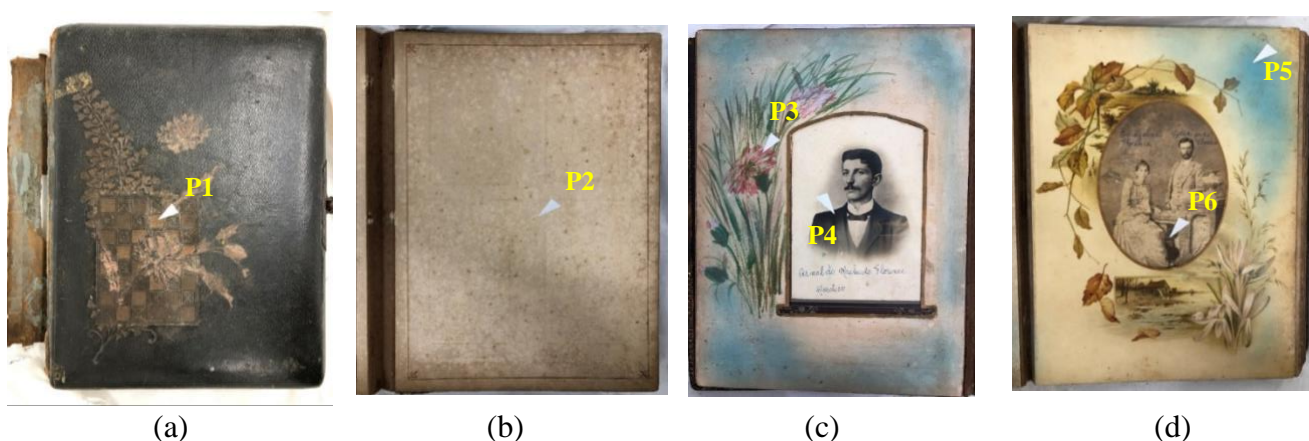
Figure 1: Locations of the measurement points in the photo album (a) P1 – album front cover; (b) P2 – endpaper; (c) P3 - rose flower engraving, P4 – photograph detail; (d) P5 – blue color, P6 – photograph detail

The PCE-CSM8 colorimeter was used at six selected points in the photo album (Fig. 1) before and after irradiation. The measurements were performed at least 48 hours after album irradiation, when the electron excitation process was already stable.