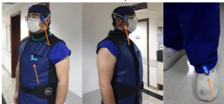
Figure 1: Instadose™ dosimeters positioned on the right (A) and left (B) sides of the region close to the eye lens, in the thorax (A - outside the lead apron) and in the region of the left ankle (C-extremity).

In each procedure, one Instadose™ dosimeter was positioned in the central region of the gantry of the equipment (Arc) in order to monitor the scattered radiation in the environment, as shown in Figure 2.