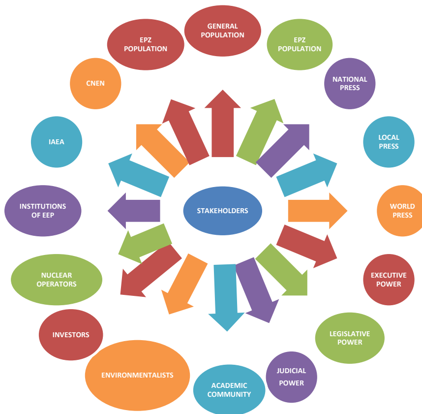
Figure 1:Communication Receivers

The importance of the SCP is due to the fact that, in the event of an emergency at the Angra I or II nuclear plants, the absence of continuous planning would increase the vulnerability of affected communities due to the lack of permanent training, which can generate a lack of communication and information between interested parties (stakeholders), as shown in Figure 1.