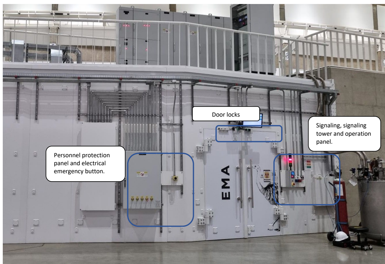
Figure 2 : Hutch of a beamline with security elements

Sirius was designed to serve the entire scientific community in the world; therefore, thousands of researchers are expected to use the beamlines for their experiments. Thus, it is essential to implement Radiological Safety training for the beamlines, enabling researchers to perform the “Search” procedure and simulate emergency conditions and beamline failures, instructing individuals on the appropriate course of action in such situations.