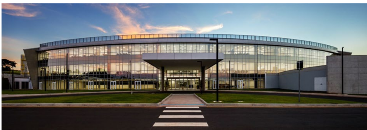
Figure 1: Sirius building

From an electron gun, by thermionic effect, the electrons are accelerated in a linear accelerator until they reach an energy of 150 MeV. For the final energy of the machine, which is 3 GeV, there is a second accelerator called an injector ring. The electron beam goes to the storage ring where it will remain in a circling orbit. At each turn, a portion of electron energy is lost tangentially to the magnetic lattice, due to the output of synchrotron radiation to the experimental stations called beamlines [1].