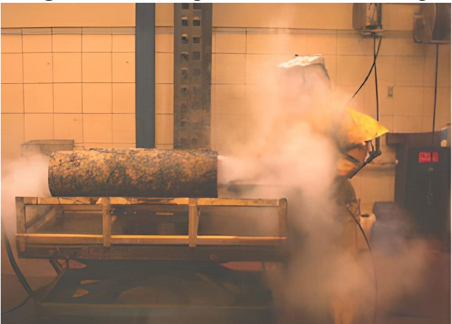
Figure 8: Ultra High-Pressure Water Jetting

So, it was observed that some countries don't emphasize the radiation protection of workers exposed to oil and gas NORM during, specifically, the activity of decontamination of equipment. This is worrying, as these workers could be exposed to external and internal radiation from NORM material due to gamma radiation as well as a great number of radioactive particles in the air (Figure 8). This situation shows the need to assess the exposure level of these workers in order to implement a more adequate radiological protection policy.