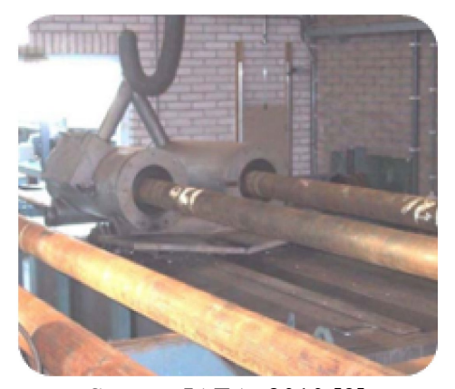
Figure 4: Mechanical removal

b) Mechanical removal: Drilling or reaming is commonly used to remove scale (hard deposits) from surface-contaminated pipes and other types of equipment. If dry drilling processes are used, the extractors must be installed in a closed system to prevent the spread of radioactive dust. Wet drilling processes will reduce or avoid the generation of radioactive dust. The wet process must also be shut down to contain contaminants and the wash water must be filtered to remove scale (Figure 4).