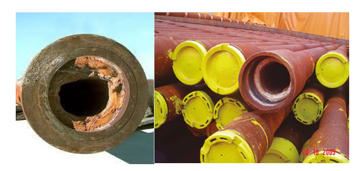
Figure 2: Pipes with Scale of oil and gas NORM