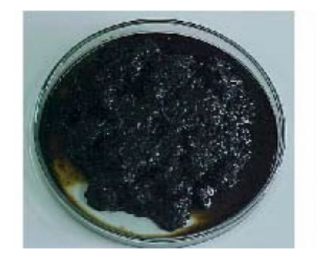
Figure 1: Sludge of oil and gas NORM

Sludge (Figure 1) is the accumulation of heavy hydrocarbons and sediments that are brought to the surface during the oil extraction process. On the other hand, the incrustation (Figure 2) is the result of mineral impurities that accumulate due to the injection of little incompatible water, evaporation in a few gases, changes in pressure, and/or temperature drops. The material is a precipitate of barium/strontium sulphate (BaSO<sub>4</sub>/SrSO<sub>4</sub>) or calcium carbonate (CaCO<sub>3</sub>) [7].