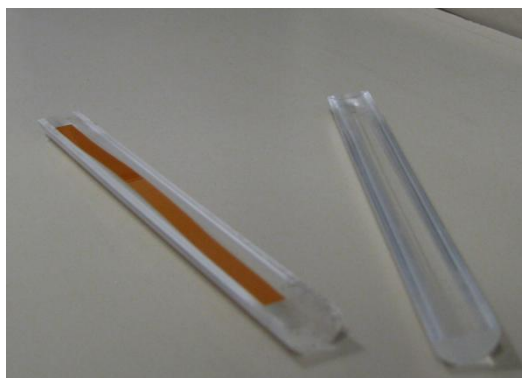
Figure 2. Rod charged with radiochromic film strip.

A RADCAL ACCU-GOLD, 10X6-3CT pencil ionization chamber with a range detection from 200 nGy to 1 kGy was used to obtain the dose deposited on the head phantom. This chamber has 4% uncertainty for X-rays generated with voltages up to 150 kV (Radcal, 2015).