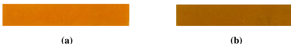
Figure 4: Radiochromic film strips: (a) background and (b) exposed.

The radiochromic films are self-developing dosimetry films, insensitive to visible light making it easy to work with during analysis and provide greater spatial resolution in the sub millimeter range (Fig. 4). They have been used extensively in combination with flat bed document scanners to measure patient doses in the kV [6,7].