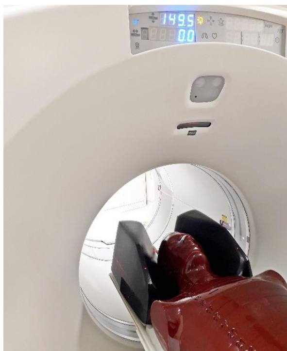
Figure 1: Positioning of the Alderson male phantom in the gantry