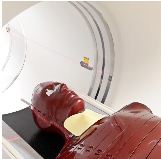
Figure 2: The phantom Alderson with the bismuth shield on the neck spot and a radio-chromic film strip on the right eye