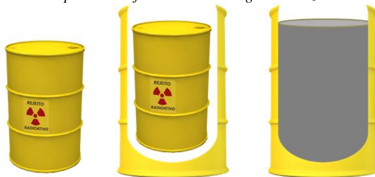
Figure 3: Encapsulation of drums containing bituminized radioactive waste.

In Romania, 60 L drums are immobilized in cement within 200 L drums, that is, their volume is increased by 3.3 times. In the Czech Republic, 100 L drums are immobilized in concrete in 200 L drums, their volume being duplicated (Figure 3) [6].