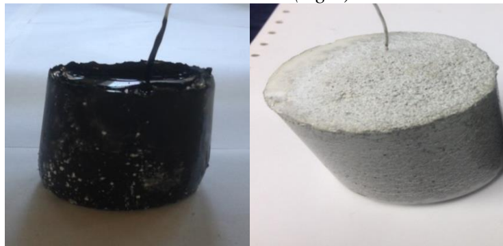
Figure 4: The sample of bitumen (left) and bitumen encapsulation it in cement paste or in mortar (right)

Different amounts of inactive cesium chloride were added to the bitumen sample (30 mg and 60 mg) to verify the degree of retention of cesium chloride when in contact with water. The determination of the leachate exchange rates and their quantities were based on ISO 6961 [17].