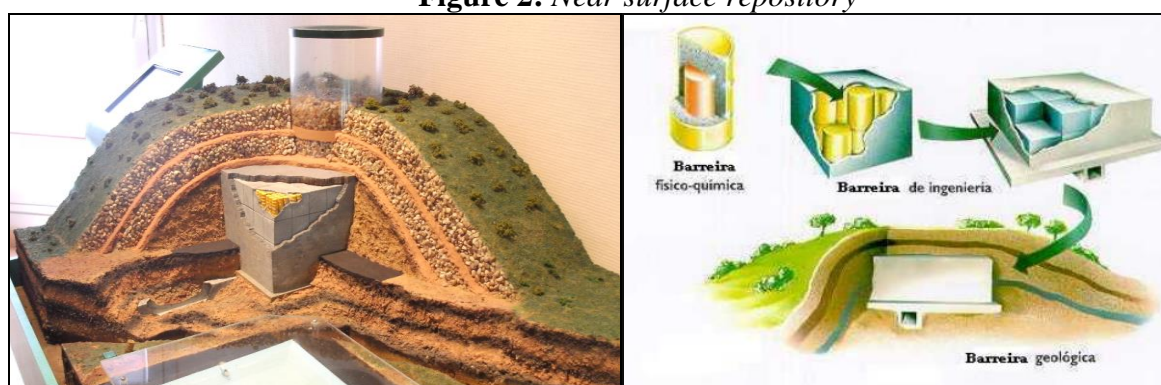
Figure 2: Near surface repository

Authors must describe materials, data, and associated protocols in order to allow other researchers to replicate the study.