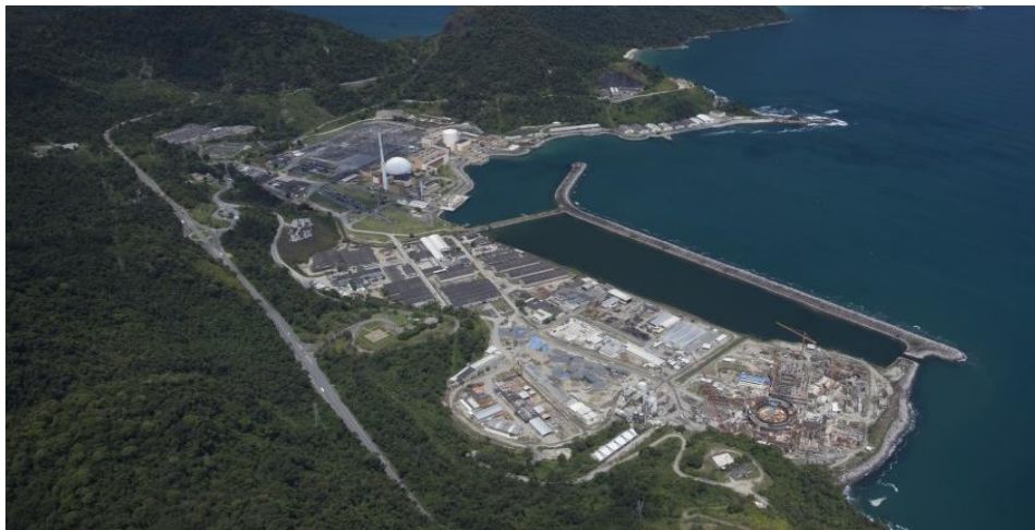
Figure 1: Brazilian Nuclear Power Plants: left below - Angra 1 and 2; right above: Angra 3 site

In the Brazilian Nuclear Program, it was predicted the construction of, at least, four nuclear power plants in the Northeastern and the Southeastern regions of Brazil, until 2030, to meet the increased use of nuclear power to generate electricity [1, 2]. With this growth and the increased use of radionuclides in different areas, the issue of radioactive waste deserves governmental actions that are being taken to resolve issues related to their storage [3].