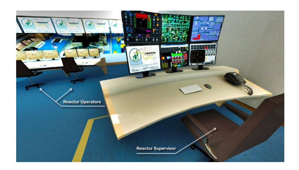
Figure 2: The Main Control Room

The MCR, showed in Figure 2, has workplaces for the reactor operators and the reactor supervisor. Each workplace contains workstations for reactor control with alarms, safety panels for the reactor protection, HSI for reactor control systems, post-accident monitoring systems and a suitable environment to house three operators for this room. The nuclear research operators interviewed recommended that the MCR must be operated by three users: two operators that use reactor control consoles to monitor and control operations, and perform routine inspections and tests. The third operator is the Supervisor, responsible for the operation that uses communication systems to inform the nuclear reactor status and supervises the operations through the HSI from his workstation that contain the same information presented in the consoles of the two other operators. According to the team experts, it is necessary that the MCR to provide the proper view of the hall where the reactor pool is located, through windows, that the operators can visualize the operations and the progress of studies carried out in that area. Above the reactor pool window there are 4 liquid crystal displays (LCD) with cameras to monitor different parts of the installation.