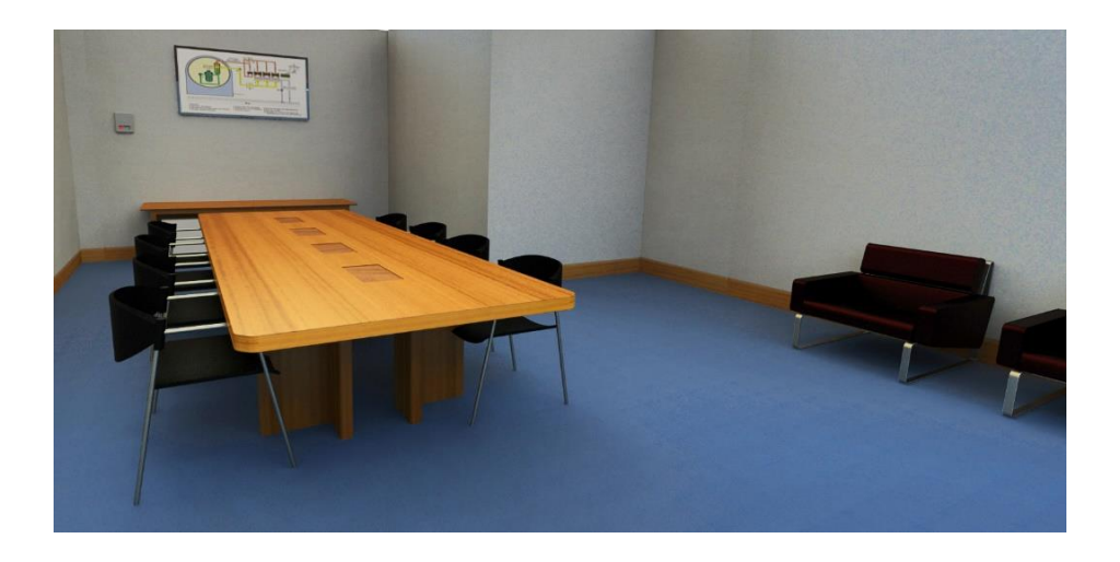
Figure 4: The technical support room

The operational support room, Figure 4, provides resources for the management and technical support of the nuclear plant during emergency situations. Peripheral tasks, not directly related to plant operation, meetings, and control of access to the MCR are managed in operational support room.