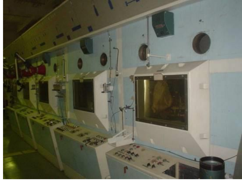
Figure 2: CELESTE Project hot cells.

require cooling during the storage, special transfer techniques and homogenization of the waste, with technologies still absent in the country, removal of radiolysis gases and thick shielding [9].