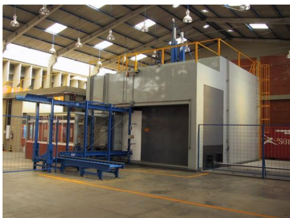
Figure 1: Multipurpose Gamma Irradiation Facility at the IPEN/SP and the schematic design of the cobalt-60 compact-type multipurpose irradiator.

Multipurpose Gamma Irradiation Facility at the IPEN, which is classified according to SSG-8 as category IV (panoramic wet source storage irradiators), Fig. 1. At the IPEN facility, the radioactive source is stored and fully shielded in a pool of 7 meters depth deionized water when not in use. Cobalt-60 source pencils (45 cm length and 1 cm diameter) are radiative material was encapsulated in corrosion resistant stainless steel such that gamma radiation can come through but not the radioactive material itself, eliminating the risk of contamination. The source pencils (48 units) were loaded into predetermined positions in source modules and distributing these modules over the source racks. The required source geometry is obtained by loading the source pencils. The racks are the structures that house all the source pencils enabling the movement of the source system from the bottom of the pool to the irradiation chamber level. The source is exposed within a radiation room that is kept inaccessible during operation by means of an entry control system.