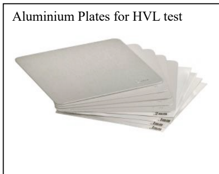
Figure 1: Quality Control Test Tools