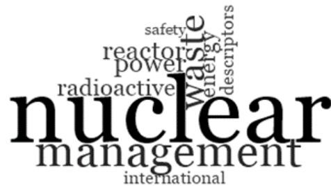
Figure 3: Visualization of miscellaneous type documents.

For report documents the NVivo program selected as the most frequent words: nuclear, management, waste, radioactive and safety. The reports agreed on miscellaneous type documents with respect to the first most frequent words, however, appeared the words radioactive and safety as a topic of interest. We can infer that this is because reports are often produced by virtue of some legal provision and that the authors of these reports have one of their safety concerns.