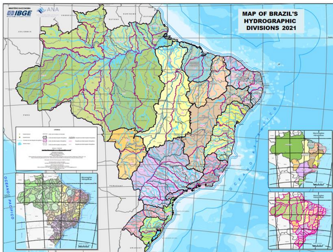
Figure 1: Region, states, and hydrographic regions of Brazil