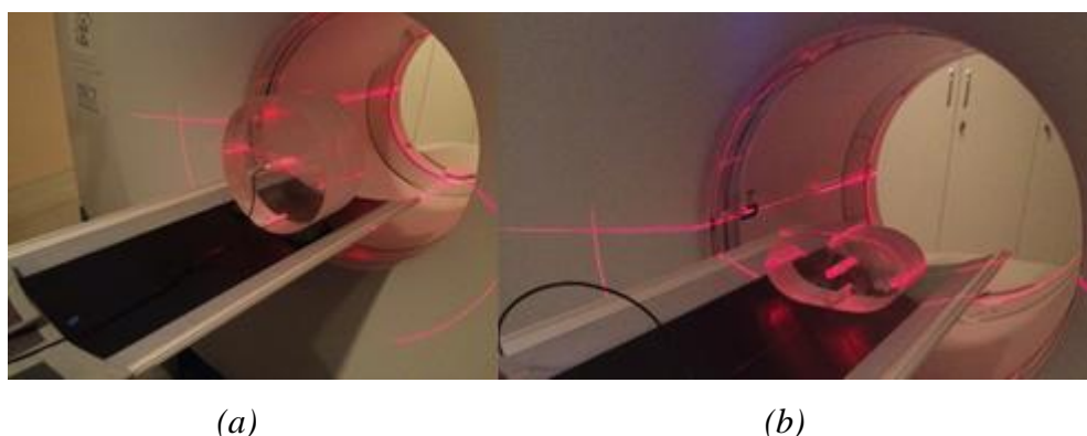
Figure 1: PMMA chest phantom images, (a) adult standard (b) oblong for two years old pediatric patient, placed in the gantry.

Both phantoms have five cylindrical spaces with a diameter of 12.7 mm for the placement of the pencil ionization chamber, one of them is central and the remaining four are peripheral lagged of 90°. Using the similarity in the positions of an analog clock, peripheral spaces were named 3, 6, 9, and 12, according to the chamber position during the irradiation of the central slice. The centers of these cylindrical spaces are located 10 mm from the edge of each phantom. The adult phantom has a cylindrical shape with a diameter of 320 mm and a length of 150 mm, while the second has an oblong shape, with dimensions 80 mm wide by 55 mm high and 150 mm in length. An image with a central slice of the two phantoms is shown in Figure 2.