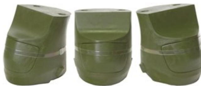
Figure 5.1. Torso and body phantom