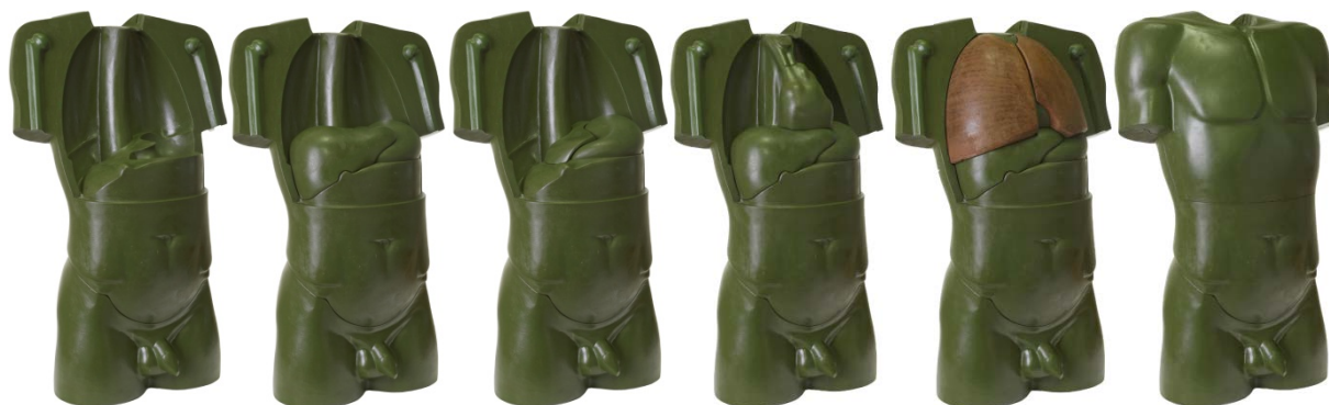
Figure 5.2. Torso and body phantom