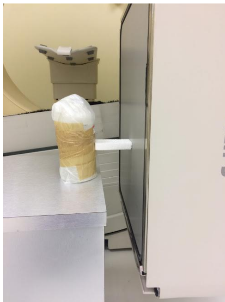
Figure 1: Calibration geometry: Plastic Bottle containing standard source of ^{152}\text{Eu} positioned at 10 cm distance to the gamma camera front face

The Efficiency x Energy curves obtained at 2 and 10 cm were used to calculate the efficiencies of the gamma camera to specific radionuclides of interest. In this work efficiencies were calculated for the 364 and 662 keV of ^{131}\text{I} and ^{137}\text{Cs} respectively. Subsequently the Minimum Detectable Activities (MDA) were calculated for the same radionuclides, which are assumed to be of concern in situations related to radiological and nuclear accidents.