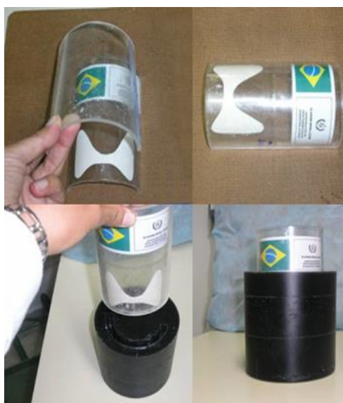
Figure 1: Neck-thyroid phantom produced in the In Vivo Monitoring Laboratory of IRD [5].

After being sealed with a plastic film, the filter paper is fixed in the proper position with an acrylic part and inserted in the neck phantom. The phantom used in this work contained originally 29771 \pm 214 Bq of ^{133}\text{Ba} in 28/April/2004, certified by the National Laboratory of Metrology of Ionizing Radiations (LNMRI) of IRD.